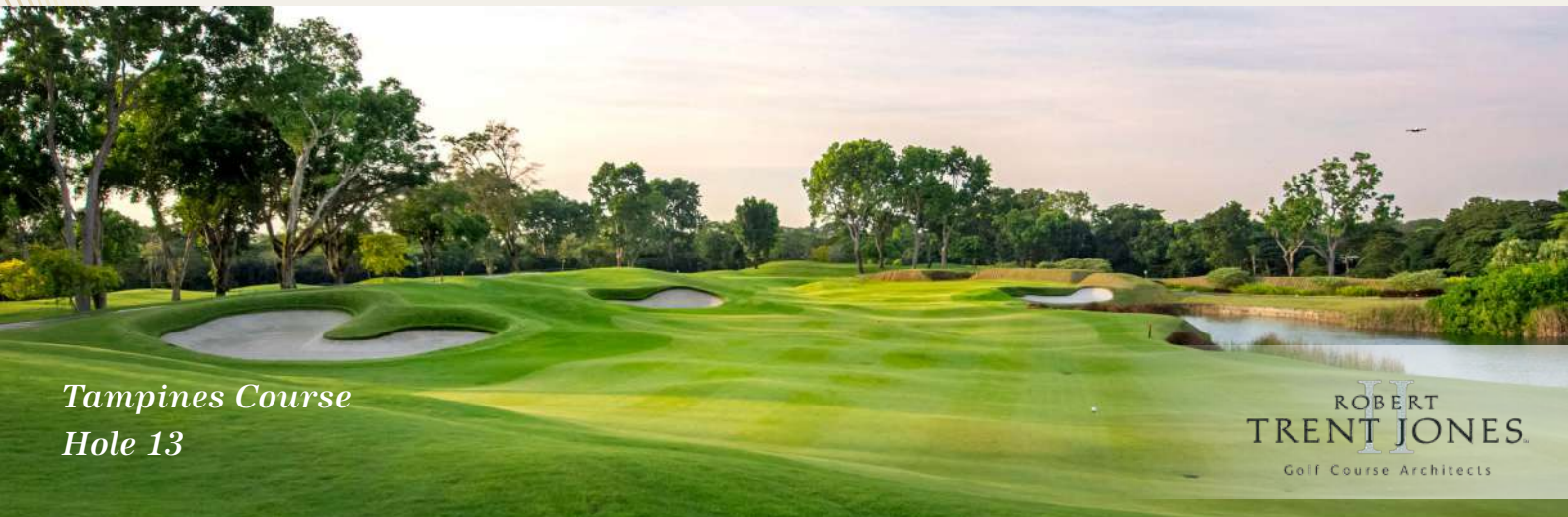
Tampines Course Hole 13

ROBERT TRENT JONES. Golf Course Architects