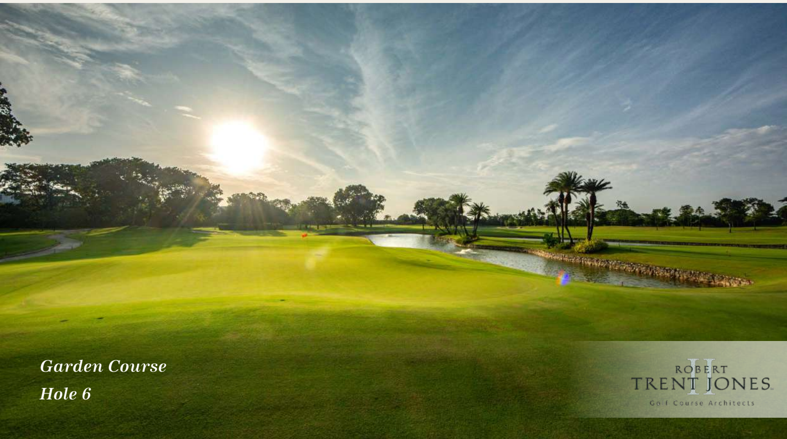
Garden Course Hole 6