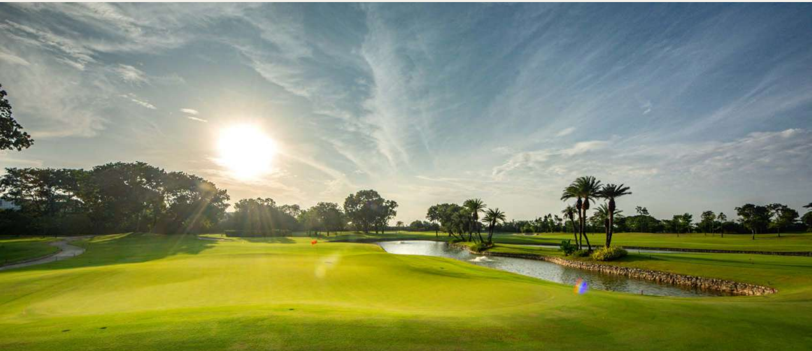
Garden Course Hole 6