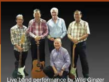
Live band performance by Wild Ginger

SPECIAL PROMOTION! Buy 3 bottles of Chivas Regal 18 years @ $408 & get one Free beer buffet.